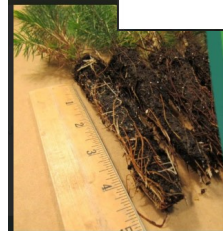
FOREVER GREEN Project 2025